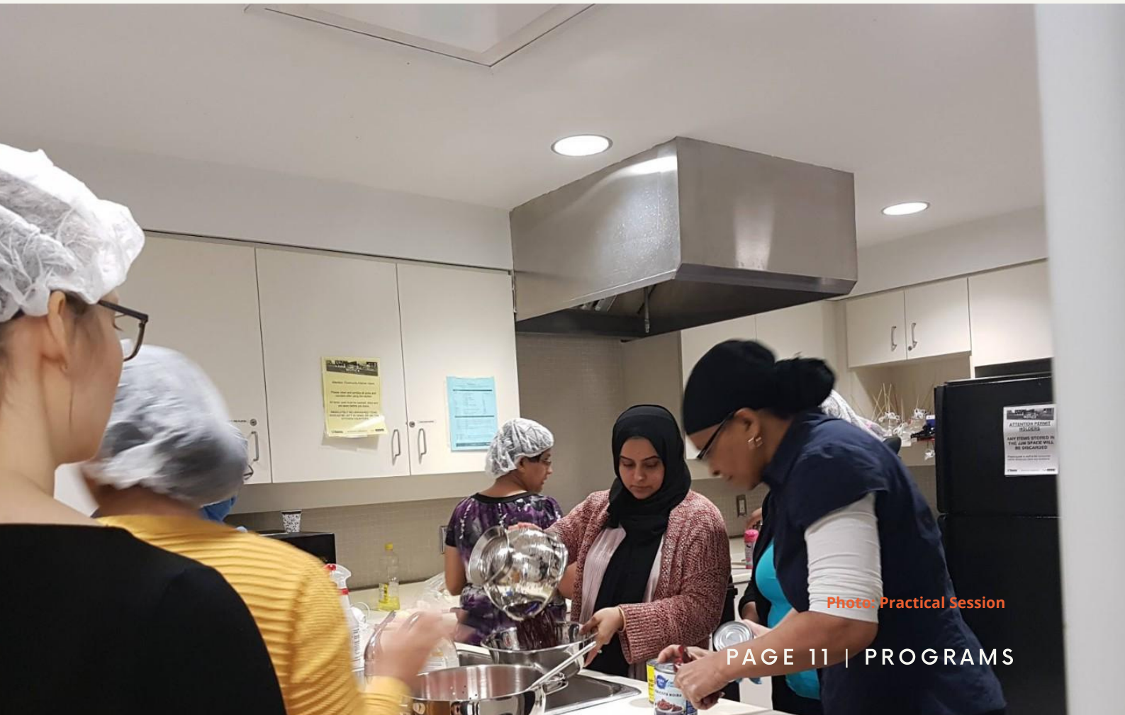
Photo: Practical Session

Our community-led development Saving Box model is geared towards both individuals and groups in low-income communities and provides them with resources and enhances their skills to successfully start-up their businesses. It consists of three streams of program delivery tailored to the size of the small start-up business, along with the specific needs of the entrepreneurs. Participants of the UC Saving Box programs receive comprehensive around services such as mentorship and coaching tailored to their unique objectives to ensure they reach their goals. The Saving Box Model enable individuals and newcomers with no credit history to gain access to knowledge, skills, supports and grants. It will also work to promote relationship between emerging local businesses and support that is available in the community to develop their businesses and markets. It leverages the synergy of participating groups by networking and promoting collaboration. They are then able to share this knowledge and skills with other members of the community, by gaining training and resources developed by UC.