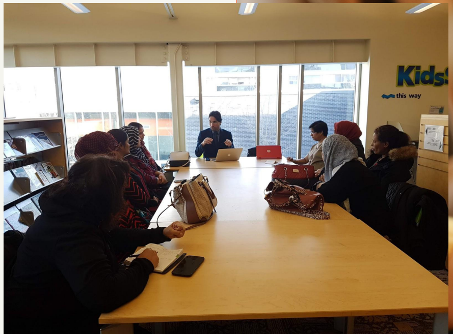
Photo: Training Session

These loans enable individuals, entrepreneurs and newcomers with no credit history to gain access to knowledge, skills, support, outreach activities and grants. These loans will also help create income generation and increase the number of local businesses in the most vulnerable communities.